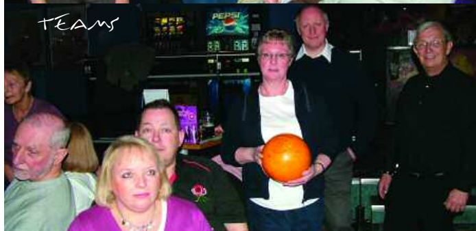
TOP SCORING LADY