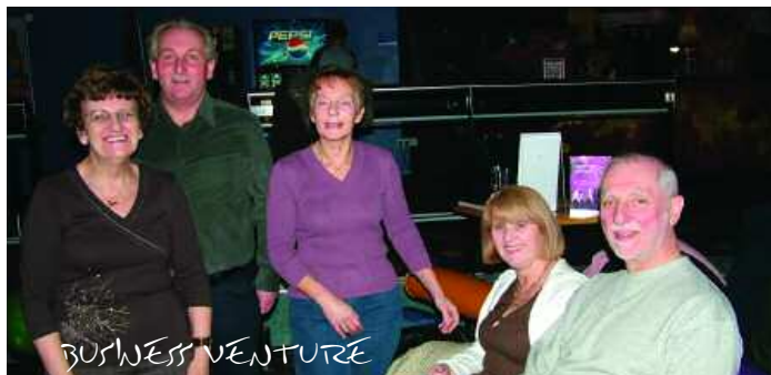
BUSINESS VENTURE TEAMS