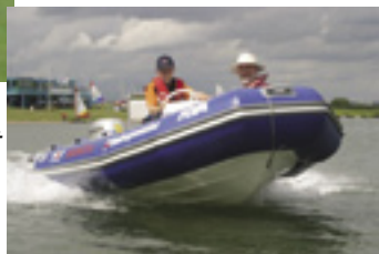
Right: A competitor at the East Midlands regional final of the Honda RYA Youth RIB championship

Ashes series was played out in a 5 match series. Matches were played at Lords, The Rose Bowl in Southampton, Horsham CC and Bradfield College in Reading. I am pleased to report that England beat the Australians 3 games to 2 in a very exciting series that saw England go two down after three matches. The final match was as exciting a game as I have ever seen with England battling against some very fine Aussie fast bowling. It was England's batting performance and the intelligent use of our B1 players that made the difference. How gratifying it is to send an Australian team home with their tails between their legs. Roll on the World Cup at Capetown in 2006!