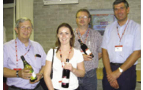
Last months prize winners

The most serious crime in networking is not to follow up the contact - Wendy will help take away the fears of making "that phone call"